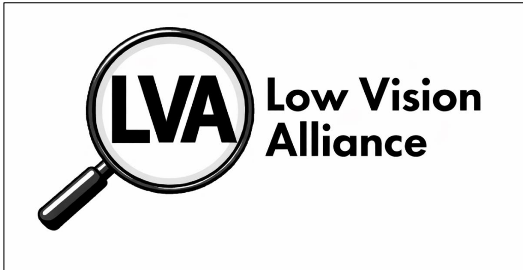
Image Above: A black and white logo with a depiction of a round handheld magnifier with its handle pointing diagonal left, displaying the letters “LVA” capitalized in bold black font within the magnifying glass. To the right, are two lines of text in smaller black font, on the first line are the words “Low Vision” and on the second line the word “Alliance”.