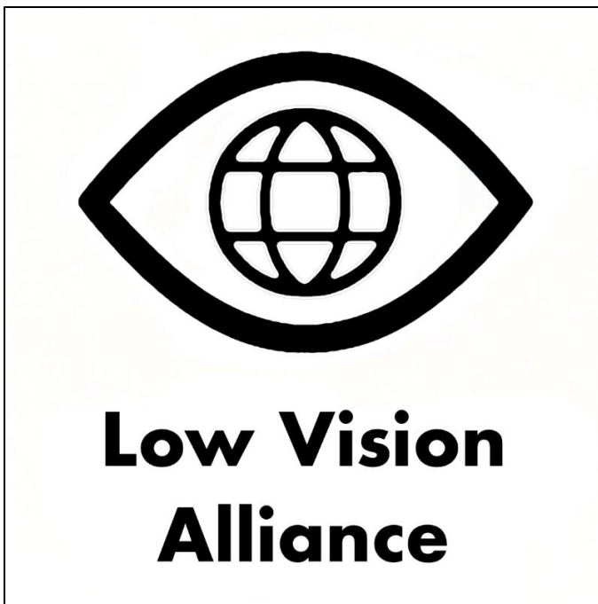
Image Left: Black-and-white logo showing a stylized eye outline with a globe icon inside. Beneath the icon, bold black text reads “Low Vision Alliance”.