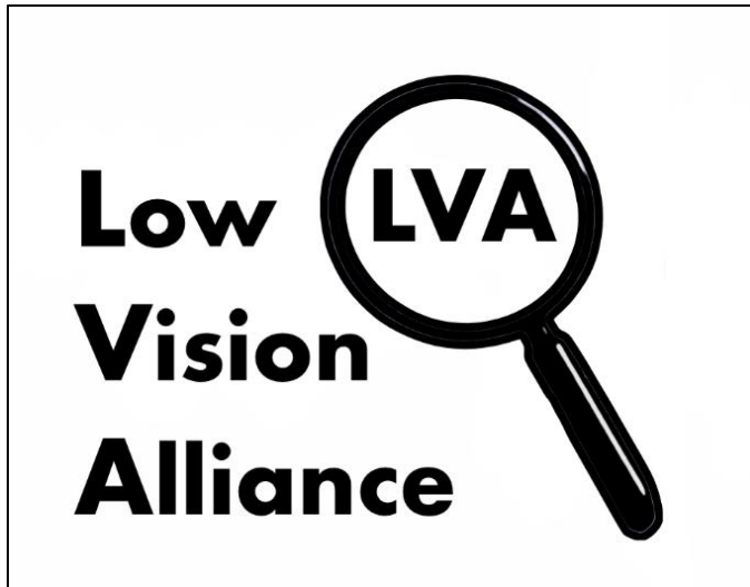
Image Left: A black and white logo with the words “Low Vision Alliance” stacked vertically in bold black font on the left-hand side. On the right side, there is a depiction of a vertically diagonally positioned round

handheld magnifier with the capital letters “LVA” displayed within the magnifying glass in black bold font.