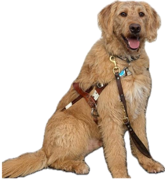
Photo Left: A golden-colored guide dog sits proudly facing the camera, wearing a brown leather guide harness and leash. The dog has curly fur, floppy ears, and an open-mouthed happy expression with its tongue slightly out. The image highlights the dog's calm, confident posture as a working guide dog trained through Freedom Guide Dogs.

by Cheryl McNeil Fisher (assisted by AI)