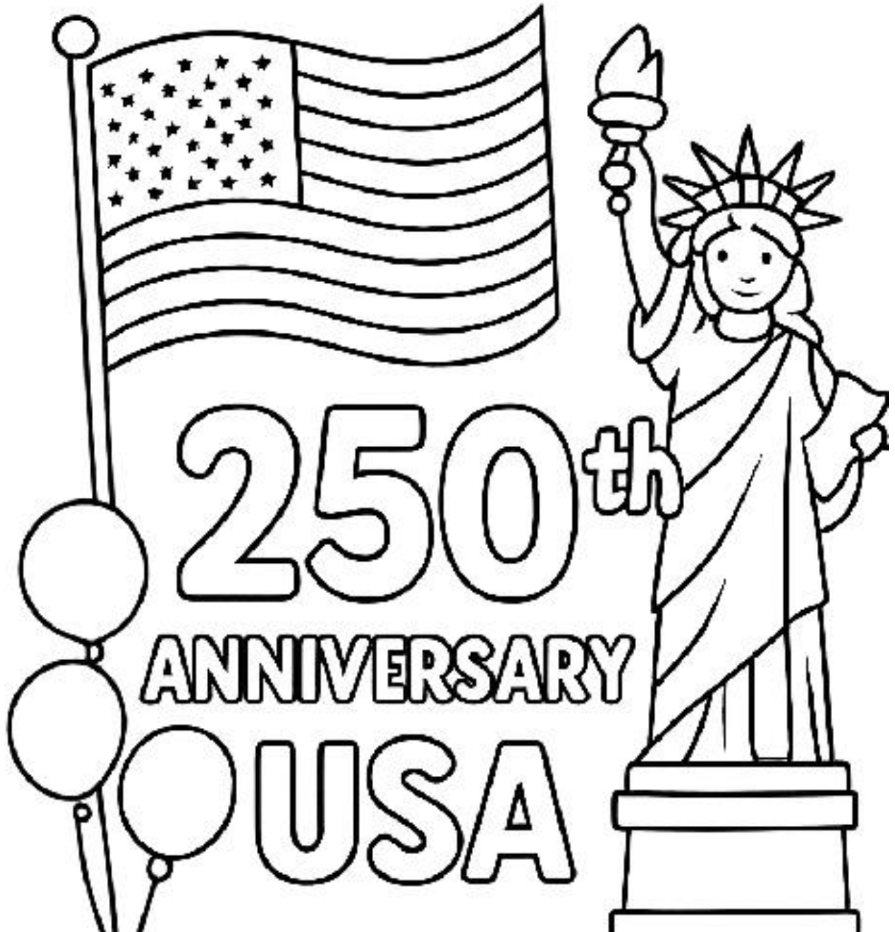
Image Above: A coloring page featuring the Statue of Liberty beside a waving American flag and balloons. Large text reads "250 th Anniversary USA.